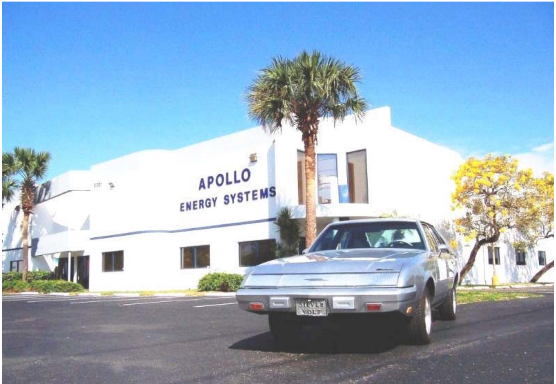
FLORIDA'S FIRST FUEL CELL PRODUCTION PLANT